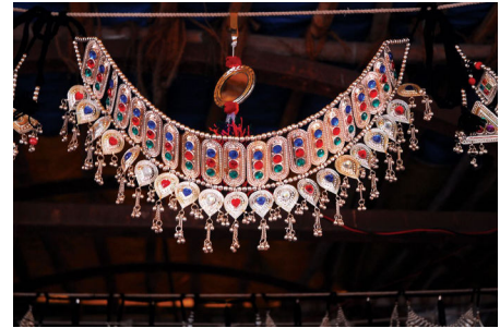
Kutch Silver Jewellery

Mandvi (75 km), founded in 1581 AD, has a fortification with 25 bastions. It is a well-known centre for production of handicrafts. Rukmavati Bridge in Mandvi was built in 1883 and is the longest existing one of its kind in India. Mandvi is also known for its beautiful silver sand beach and the imposing Vijayvilas Palace. Bhadreswar (75 km) is the site of the ancient Bhadravati Nagri of King Yuvnashva mentioned in the Mahabharata. Dholavira, one of the oldest and largest Indus Valley Civilisation sites in India, is about 100 kilometres from Bhuj.