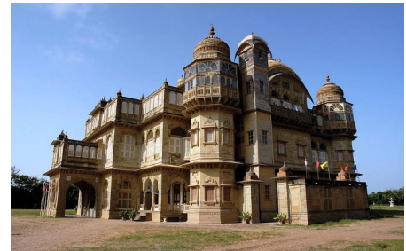
Vijay Vilas Palace